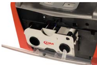
Ribbon cartridge EasyLoad

Upgrade: possibility of future expansions and updates in order to deal with new requirements of your business. You can choose among 56 possible configurations! Wide choice of smart card, contact and contactless options. 2 years warranty on the machine and the printhead.