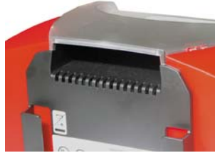
Anti-slip rear manual grip